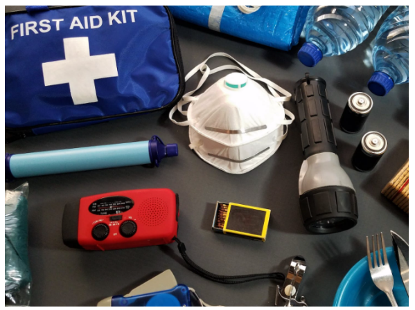
Example of some items that might be found in a hurricane emergency kit