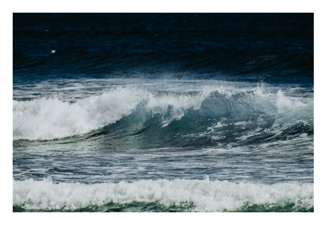
Hurricanes can be incredibly powerful, capable of causing large waves and strong winds.

Hurricanes are some of the most potent natural disasters on our planet. Their strong winds can reach incredible speeds, blowing everything in their path. These mighty storms can also generate enormous waves that crash onto the shores, causing flooding and damage to buildings and trees.