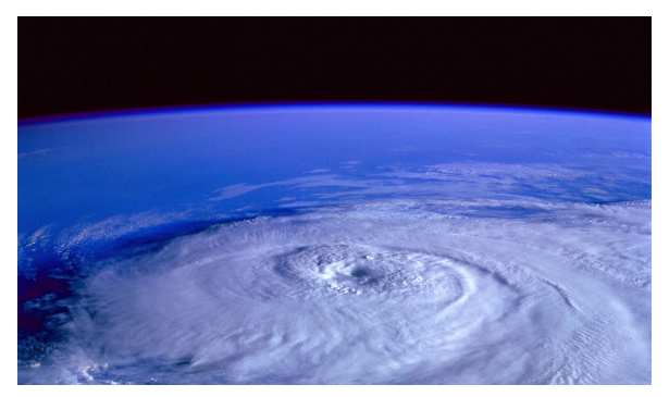
A view of a hurricane from above the Earth's atmosphere.

Hurricanes are massive storms that form over warm ocean waters. They are like giant whirlwinds with powerful winds and heavy rain. The center of a hurricane is called the "eye," which is usually calm and clear. But don't be fooled! The area surrounding the eye, known as the "eyewall," is the most intense part of the storm.